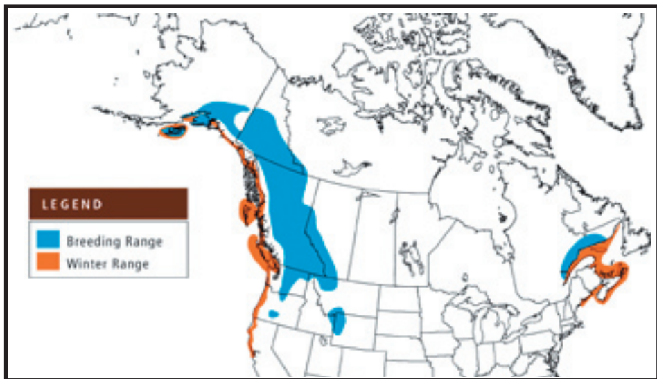
Distribution of Barrow's Goldeneye in North America

They are generally monogamous and form pairs while on wintering grounds. Females do not breed until their third year or later, but younger birds will return to their natal area during the breeding season to prospect for future nest sites.