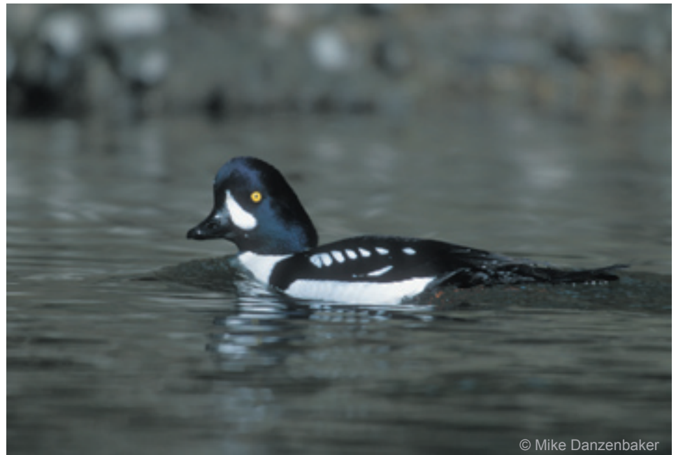
Male Barrow's Goldeneye

The breeding range of Barrow's goldeneyes is generally restricted to areas west of the Rocky Mountains from Montana to Alaska, and to a core breeding area in the east on the high plateau along the north shore of the St. Lawrence estuary and gulf. There is no evidence of exchange between the eastern and western populations.